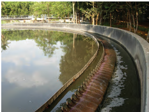
Fig. 13.5 Water clarifier

a scraper. This is the sludge . A skimmer removes the floatable solids like oil and grease. Water so cleared is called clarified water (Fig. 13.5).